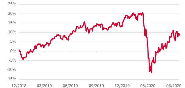
— Adventurous Ready-made portfolio